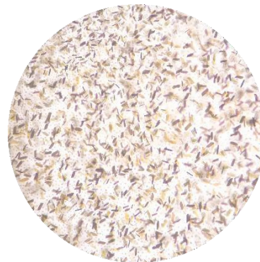
Teichmann test showing positive result