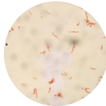
Takayama test showing Positive result